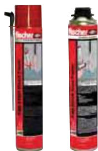
FireStop hand foam