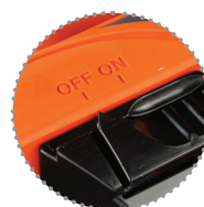
On / Off battery