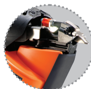
Self locating probe