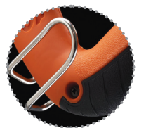
Reversible belt hook