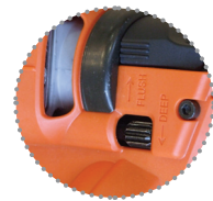
Tool free depth of drive adjustment