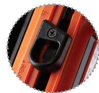
Fastener lockout nail